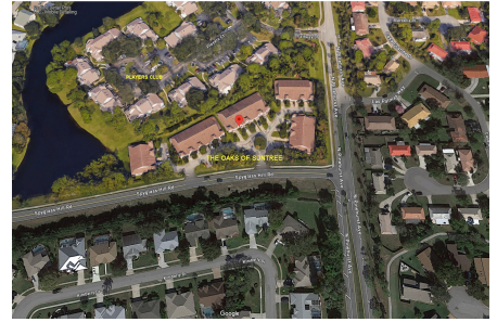
Built in 1999 - 21 units - 1 floor