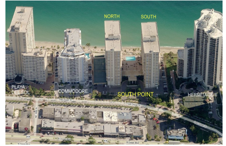
Built in 1975 - 200 units - 21 floors

Southpoint Condominium Association (954) 563-6353