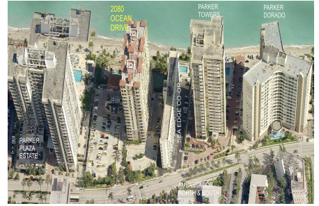
Built in 2003 - 233 units - 18 floors

2080 Ocean Drive Condominium association front desk: (954) 456-0200 main office: (954) 456-5215 manager2080@yahoo.com