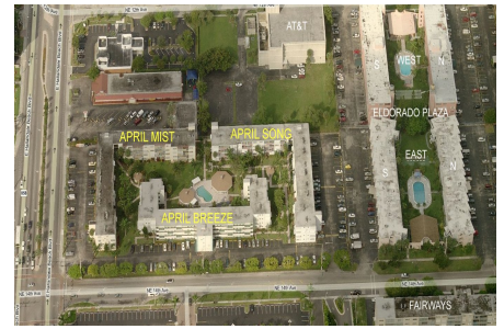
Built in 1967 - 174 units - 4 floors

April Song Condo Association (954) 458-2412 April Mist Condo Association (954) 458-8337 April Breeze Association, Inc. (954) 458-8085