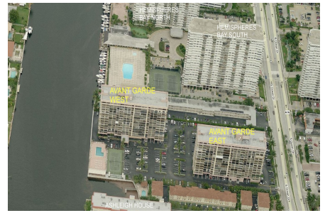
Built in 1975 - 140 units - 15 floors

Avant Garde Condominium Association Inc (954) 454-7585