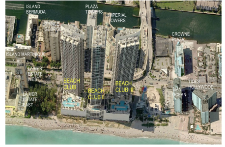
Built in 2005 - 385 units - 44 floors

http://www.atlanticandpacific.net/beachclub/sub_category_list.asp?category=5&title=Cont