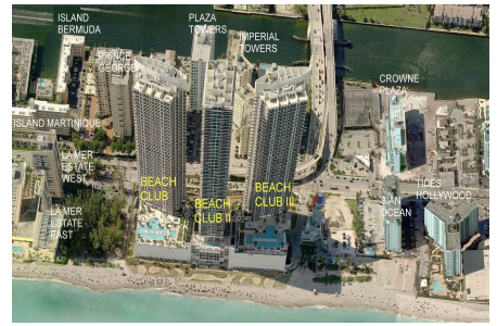
Built in 2006 - 483 units - 51 floors

Beach Club 2 Condominium association (954) 457-4622