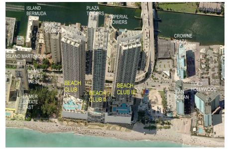
Built in 2007 - 389 units - 44 floors

Beach Club 3 Condominium association (954) 457-8587