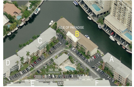
Built in 1966 - 29 units - 3 floors

Isle Of Paradise B Inc Monticell 450 Paradise Isle Boulevard Hallandale Beach, FL 33009-5896 (954) 458-8498