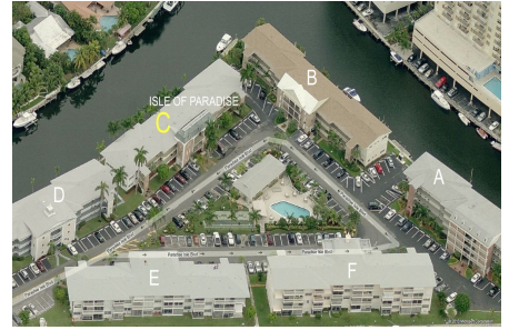
Built in 1965 - 30 units - 3 floors

Isle of Paradise C Inc 460 Paradise Isle Blvd Hallandale Beach, FL 33009 (954) 456-6084