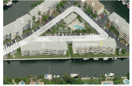
Built in 1969 - 36 units - 4 floors

Isle Of Paradise B Inc Monticell 450 Paradise Isle Boulevard Hallandale Beach, FL 33009-5896 (954) 458-8498 Isle of Paradise C Inc 460 Paradise Isle Blvd Hallandale Beach, FL 33009 (954) 456-6084