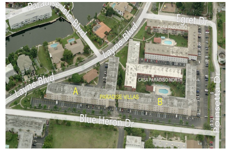
Built in 1996 - 132 units - 3 floors

Paradise Villas Condo Association 400 Layne Boulevard Hallandale, FL 33009 (954) 456-7205