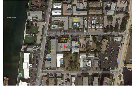
Built in 2006 - 25 units - 6 floors

Pompano By the Sea Condominium Address: 3212 NE 12th St apt #304, Pompano Beach, FL 33062 Phone: +1 954-783-3474