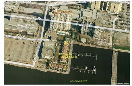
Built in 2002 - 20 units - 2 floors

Plaza Condominium Association-Berkman Address: 400 E Bay St, Jacksonville, FL 32202, Phone:+1 904-359-5938 http://www.theplaza1.com/