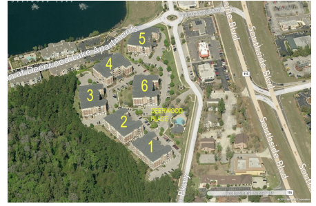
Built in 2005 - 182 units - 5 floors

Deerwood Place Condominiums Madison Property Management Mailing Address: 7643 Gate Parkway Suite 104 PMB 188 Jacksonville, FL 32256 Physical Address: 6960 Bonneval Road, #302 Jacksonville, FL 32216 (904) 641-1858 (Phone) (904) 641-1171 (FAX) http://www.deerwoodplacecondos.com/