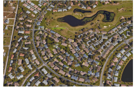
Built in 1988 - 124 units - 1 floor

Number of units: 124 Number of active listings for rent: 0 Number of active listings for sale: 7 Building inventory for sale: 5% Number of sales over the last 12 months: 7 Number of sales over the last 6 months: 4 Number of sales over the last 3 months: 3