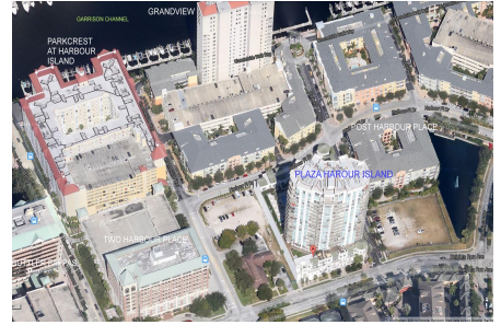
Built in 2009 - 141 units - 21 floors

Plaza Harbour Island Condominium Association Inc 450 Run Ave Tampa, FL 33602-3360 (813) 226-8585