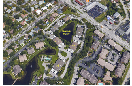
Built in 1984 - 48 units - 2 floors