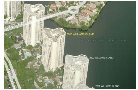
Built in 1989 - 181 units - 32 floors

Williams Island Limited 3000 Island Blvd, Aventura, FL 33160 (305) 937-3019