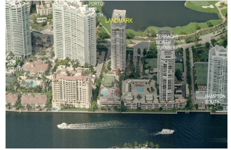
Built in 1990 - 183 units - 29 floors

Landmark Club Condominium (305) 933-2349