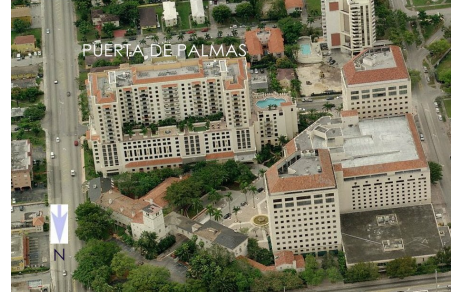
Built in 2006 - 197 units - 16 floors

Puerta De Palmas Luxury Condominiums 786-953-1888 & info@puertadepalmas.com