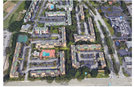
Built in 1972 - 300 units - 4 floors