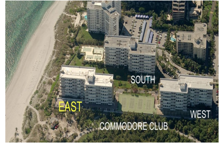
Built in 1971 - 185 units - 12 floors

Number of units: 185 Number of active listings for rent: 4 Number of active listings for sale: 2 Building inventory for sale: 1% Number of sales over the last 12 months: 7 Number of sales over the last 6 months: 3 Number of sales over the last 3 months: 3