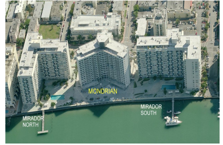
Built in 2008 - 334 units - 15 floors