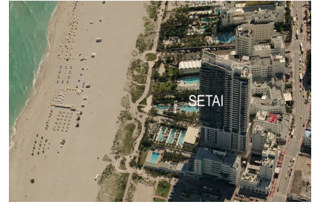
Built in 2001 - 250 units - 39 floors