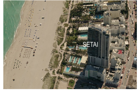
Built in 2001 - 250 units - 39 floors