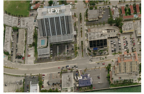
Built in 2007 - 164 units - 19 floors