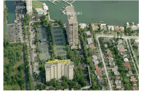
Built in 1972 - 90 units - 13 floors

Jockey Club Maintenance Association Inc 11111 Biscayne Blvd, Miami, FL 33181 (305) 891-2728