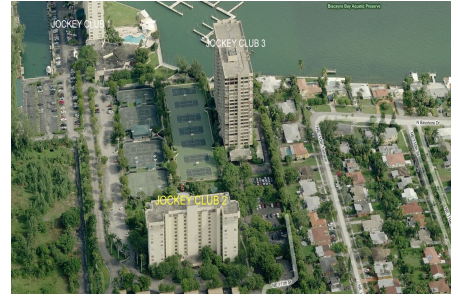
Built in 1972 - 90 units - 13 floors

Jockey Club Maintenance Association Inc 11111 Biscayne Blvd, Miami, FL 33181 (305) 891-2728