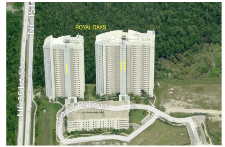
Built in 2007 - 149 units - 26 floors

Biscayne Landing Property Management Company 15051 Royal Oak Ln North Miami, FL 33181 786-629-5148