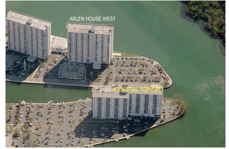
Built in 1965 - 424 units - 15 floors

Coastal Towers condominium (305) 944-5778