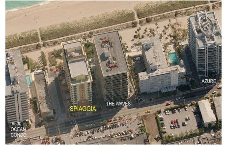
Built in 1965/2005 - 104 units - 12 floors