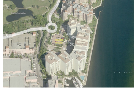
Built in 1999 - 137 units - 12 floors

Mizner Grand Condo Associates Address: 500 SE 5th Ave, Boca Raton, FL 33432 Phone:(561) 362-4465 http://www.mizner-grand.com