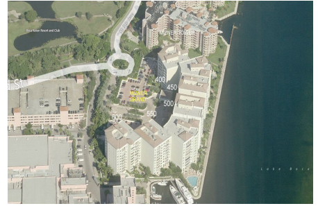
Built in 1999 - 137 units - 12 floors

Mizner Grand Condo Associates Address: 500 SE 5th Ave, Boca Raton, FL 33432 Phone:(561) 362-4465 http://www.mizner-grand.com