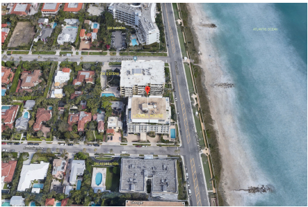
Built in 1967 - 29 units - 6 floors