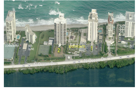
Built in 1981 - 69 units - 25 floors

Eastpoint Condominium Association, Inc 5380 N Ocean Drive Riviera Beach, FL 33404-2515 (561) 842-6771