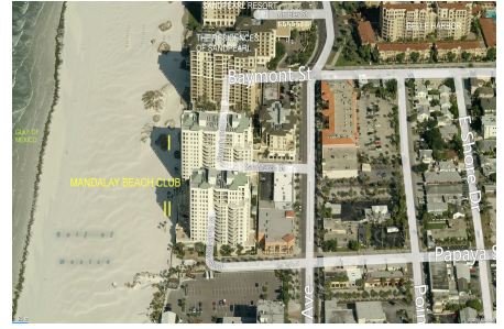
Built in 2002 - 91 units - 16 floors

Mandalay Beach Club Owner's Association, Inc 10 Papaya Street Clearwater Beach, FL 33767 Phone: (727) 449-8852 (727) 442-8819 Fax: (727) 442-8859 http://mbcmanager@themandalaybeachclub.com