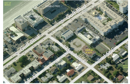
Built in 1988 - 6 units - 3 floors

HERON PLACE CONDOMINIUM ASSOCIATION, INC 200 171ST AVE E North redington beach, Florida 33708