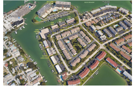
Built in 1972/1980 - 43 units - 3 floors