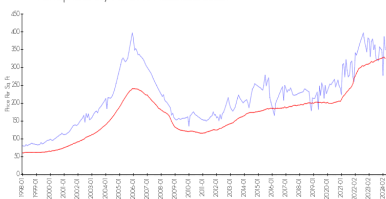
Hemispheres Bay North vs Hallandale Beach