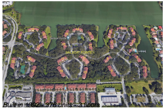
Built in 1992 - 376 units - 5 story floors