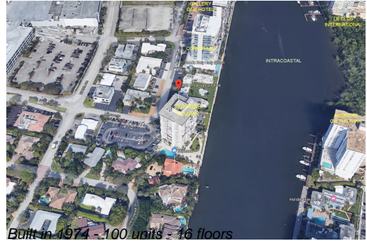
Built in 1974 - 100 units - 16 floors