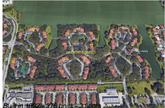
Built in 1992 - 376 units - 5 story floors