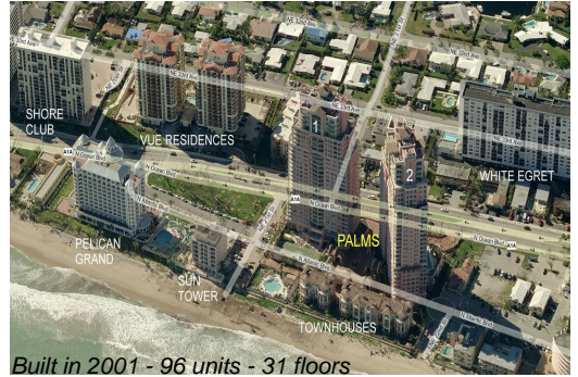
Built in 2001 - 96 units - 31 floors