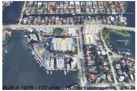
Built in 1978 - 170 units, 18 floors

The above valuated price is a baseline figure that does not take into account any specific renovation, upgrade, split, merge, or deterioration of the unit.