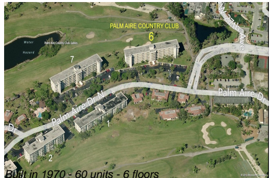
Built in 1970 - 60 units - 6 floors