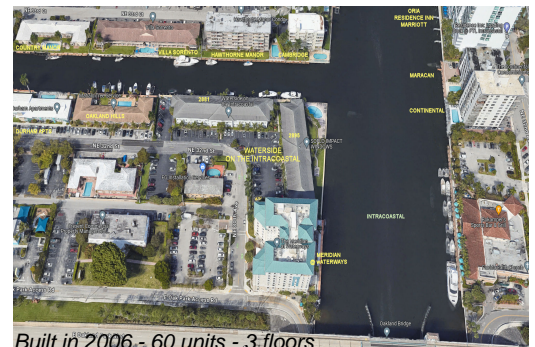
Built in 2006 - 60 units - 3-floors