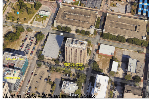
Built in 1949 - 205 units - 6 stories