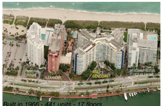
Built in 1966 - 441 units - 17 floors