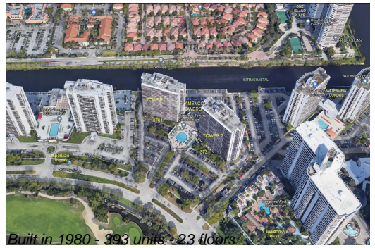
Built in 1980 - 393 units - 23 floors

MLS Number: A11519768 Status: Active Size: 1,068 Sq ft. Bedrooms: 2 Full Bathrooms: 2 Half Bathrooms: Parking Spaces: View: Canal, Other View Rental Price: $3,100 List PPSF: $3 Valuated Price: $357,000 Valuated PPSF: $334