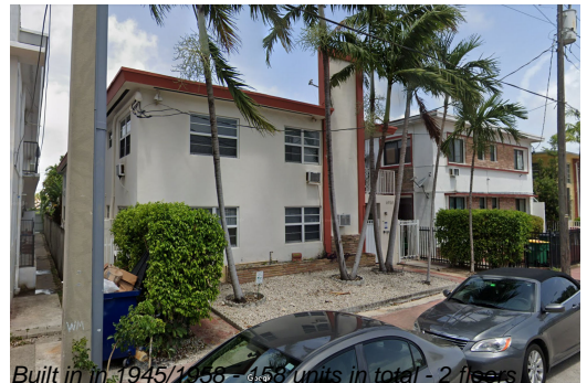
Built in 1945/1956 - 6158 units in total - 2 floors