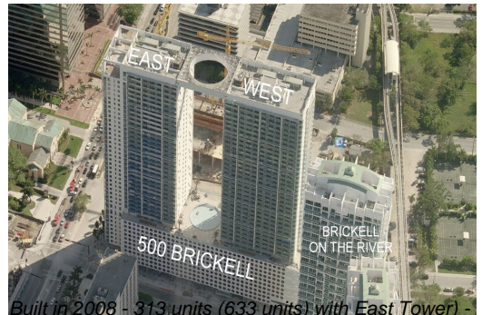
Built in 2008 - 313 units (633 units) with East Tower) - 43 floors