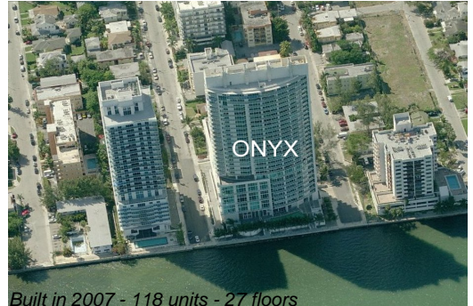
Built in 2007 - 118 units - 27 floors